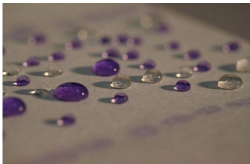
Fig: 1 Mediatrons