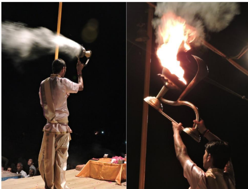
Figure 3: Priests performing puja at the Ghats of Varanasi.