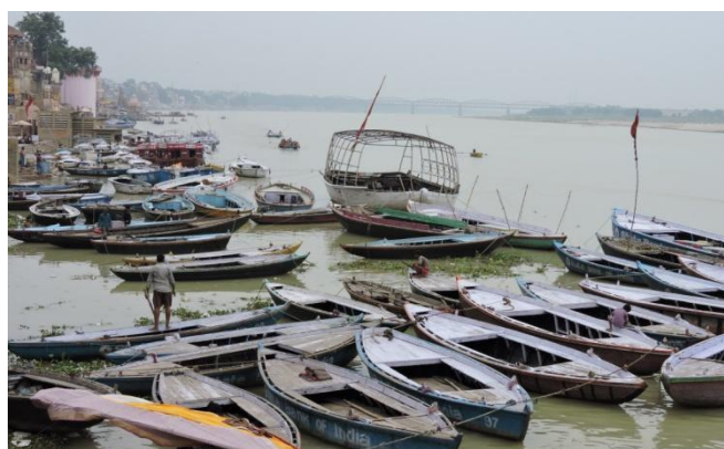
Figure 5: Crowding of boats along the banks of Varanasi.

1. During the British rule, the city was given due importance to the construction of well-designed underground gravity sewage. Along with it, flushed toilets were installed and other required urban infrastructure were also laid. On the contrary, the present population of the city is about 1.5 million but the infrastructure then created has still not been improved to a significant level. The sewage system has become old and is unable to accommodate the present population which is spreading in an unplanned manner.