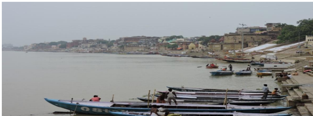
Figure 2: Dashashwamedh Ghat of Varanasi.

The 84 Ghats of the river Ganga along the city of Varanasi is a sign of divinity endured in physical, metaphysical and supernatural elements. Sraddha is performed at these Ghats along with gifts and land donations are also made in the name of Brahmans who officiate various rituals. Taking a holy dip along the Ghat in river Ganga is considered to be pious deed. Many of the Ghats were built when the city was under control of the Marathas.