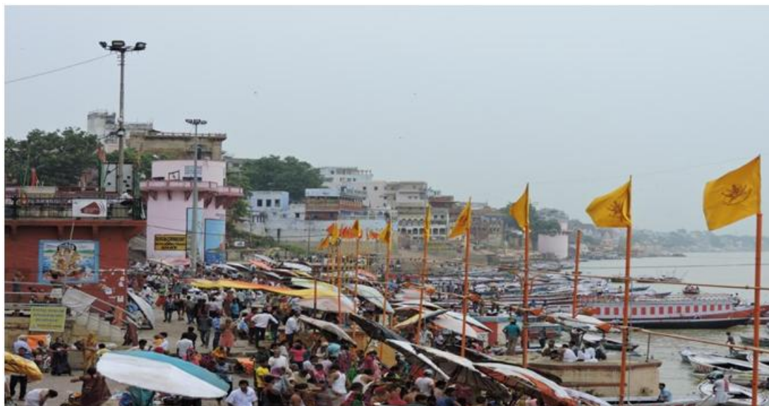
Figure 4: Over pollution at the Ghats in Varanasi.

1. During the British rule, the city was given due importance to the construction of well-designed underground gravity sewage. Along with it, flushed toilets were installed and other required urban infrastructure were also laid. On the contrary, the present population of the city is about 1.5 million but the infrastructure then created has still not been improved to a significant level. The sewage system has become old and is unable to accommodate the present population which is spreading in an unplanned manner.