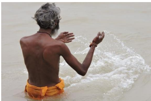
Figure 6: Priest bathing on river Ganga,

7. In 1986, according to Government's estimates, about 147 million litres per day (MLD) of sewage and industrial waste generated in Varanasi flowed into the Ganga. Now, over 200 MLD of wastewater is flowing into the river.