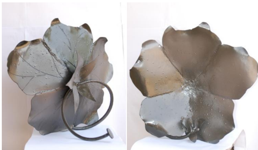
Plates 5 and 6, Leni Satsi, Multifaceted, 50x53cm, Sheet metal, iron rods and bearings, 2012