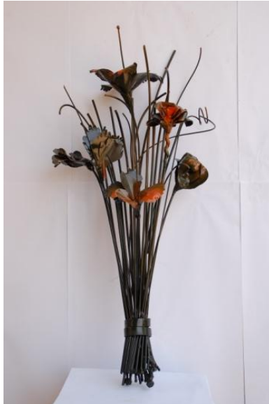
Plate 4, Leni Satsi, Broom , 81 cm, sheet metal, 2012

The concern here is that Africans could gather broom sticks together for sweeping but couldn't gather flowers in the same manner and just gaze at them in their homes when it has the power to liven up and relax its viewers. The work is a careful arrangement of iron rods of different thicknesses to form a relief bunch held together by a band. Some of the strands that form the bunch extend from the band to end with some beautifully shaped flower at their tips