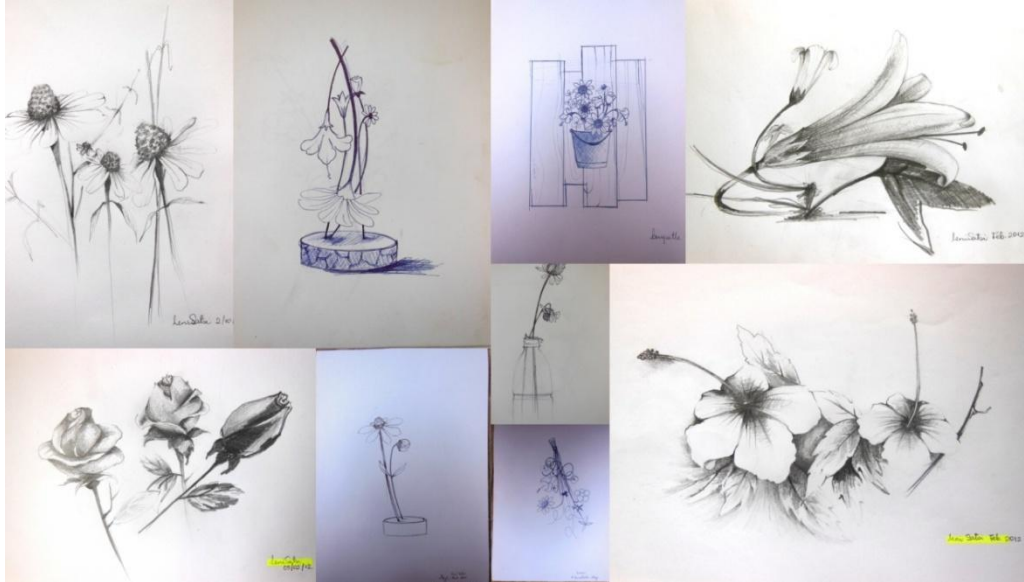
Plate 1: flower study, Artist sketch book (2012)

Observation: The observatory stage resulted in a series of sketches that were further developed. This step provides for a proper understanding of the subject matter and formed the foundation for the studies.