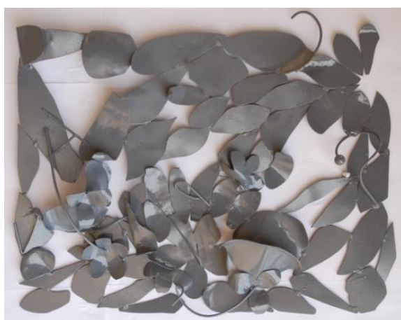
Plate 7, Leni Satsi, Fall I, 58.4X76.2 cm, sheet metal and iron rods, 2012

The sculpture is a juxtaposition of several petals of different sizes and shapes, put together in a rectangular picture frame. They are painted in a flat grey colour and mounted on a flat wall.