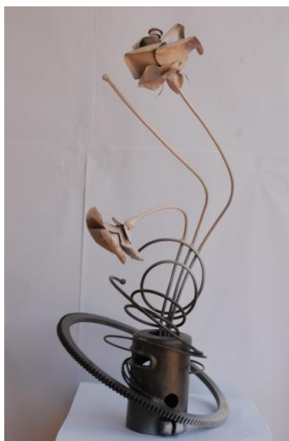
Plate 3, Leni Satsi, Spiral Rose , 71cm, mild steel, aluminium and iron rods,2012

The spiral lines suggest wind action and continuity. It also symbolizes the hostility we dish out to nature. We often put nature in an unfavorable condition which eventually truncates their existence. The Rose itself symbolizes love, friendship and partnership a relationship built between people as they interact. Everywhere, people make friends; we make partners in business, in sports and other aspects of life. This partnership should be symbiotic rather than parasitic.