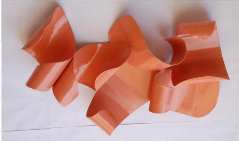
Plate 8, Leni Satsi, Fall II , 66cm, sheet metal, 2012