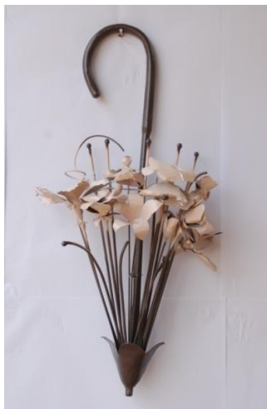
Plate1, Leni Satsi, Umbrella, 68.5 cm, sheet metal and iron rods, 2012

The object represented in this composition is an umbrella, bearing several flowers. It resembles a flower bulb turned upside down. The tip of the half –way opened umbrella is dressed with a small lily that serves as the junction or the source of the several stalks of the flower. From the small lily a thick rod extends upward and is curved at the end to form the handle of an umbrella. It is an umbrella and at the same time a collection of flowers. An umbrella provides us with comfort and in addition, beauty and scent that comes from the flowers which are found around our homes, offices, schools, hostels, and hospitals. The artist has depicted some irregularities in the flowers and despite their disparity in types they sit together to provide that ideal comfort which flowers give us. Unless we are careful, we may not see some of the things that flowers do for us.