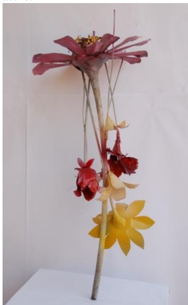
Plate 2, Leni Satsi, Grief , aluminium, sheet metal and iron rods, 2012

hand the human is very conscious of their temporal beauty. Humans are also responsible for the destruction of flowers and several other elements of nature.