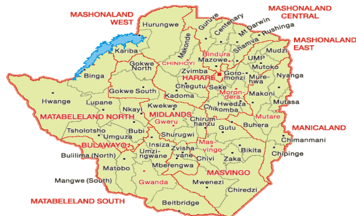
Figure 1: Map of Zimbabwe showing Provinces and Districts