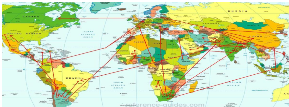
Fig-2; Trafficking in the World