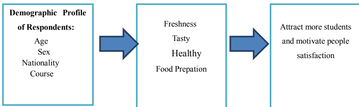
Fig. 1 Conceptual Paradigm Showing the Relationship of the Independent Variable and Dependent Variable