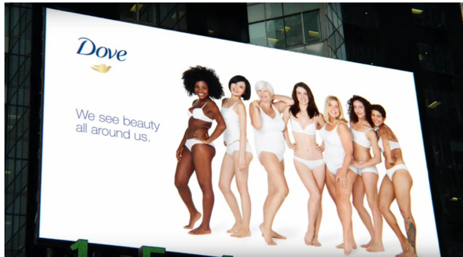
Figure 1: Dove Real Beauty Campaign, 2017 [18]

(e) Societal Impact: The campaign has initiated a broad discussion about beauty standards and how the media shapes these standards. This has highlighted the brand's commitment to social responsibility and its emphasis on societal values.