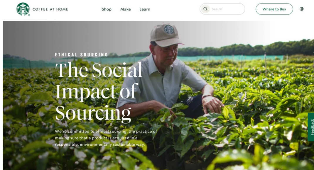
Figure 3: Starbucks' Ethically Sourced Coffee Campaign [20]

Starbucks' "Ethically Sourced Coffee" campaign effectively utilizes visual cues to convey the brand's commitment to sustainability and social responsibility. The campaign emphasizes Starbucks' dedication to ethical and sustainable practices at every stage of its coffee supply chain. It underscores the brand's serious commitment in this regard and how it supports ethical practices within the coffee supply chain.