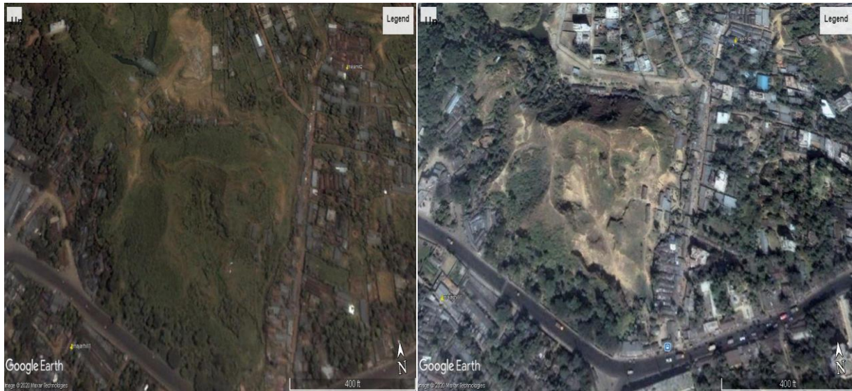
Akbar Shah Mazar-2001