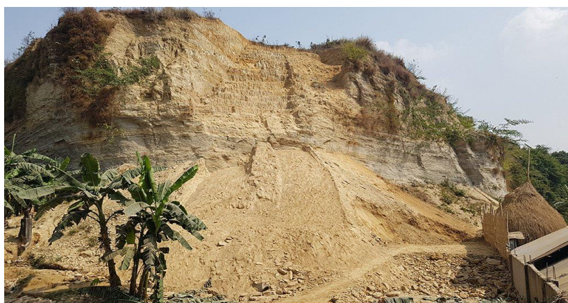
Figure-2: Hill being cut down illegally in Chittagong.