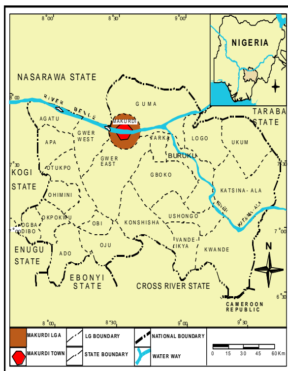
Fig1. Benue State Showing Makurdi Town

hotel and even commercial sex workers are also carried out in the area. Crop farming is also practiced in the area on a subsistence but intensive scale producing crops like rice and vegetable.