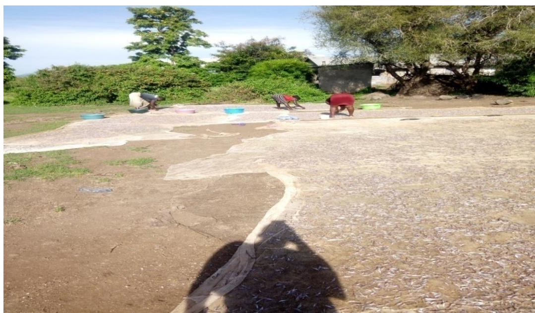
Figure 1.2: A group of women engaged in “omena” drying at a landing beach in Mbita. Men do not participate in such activities due to low incomes from the activity.