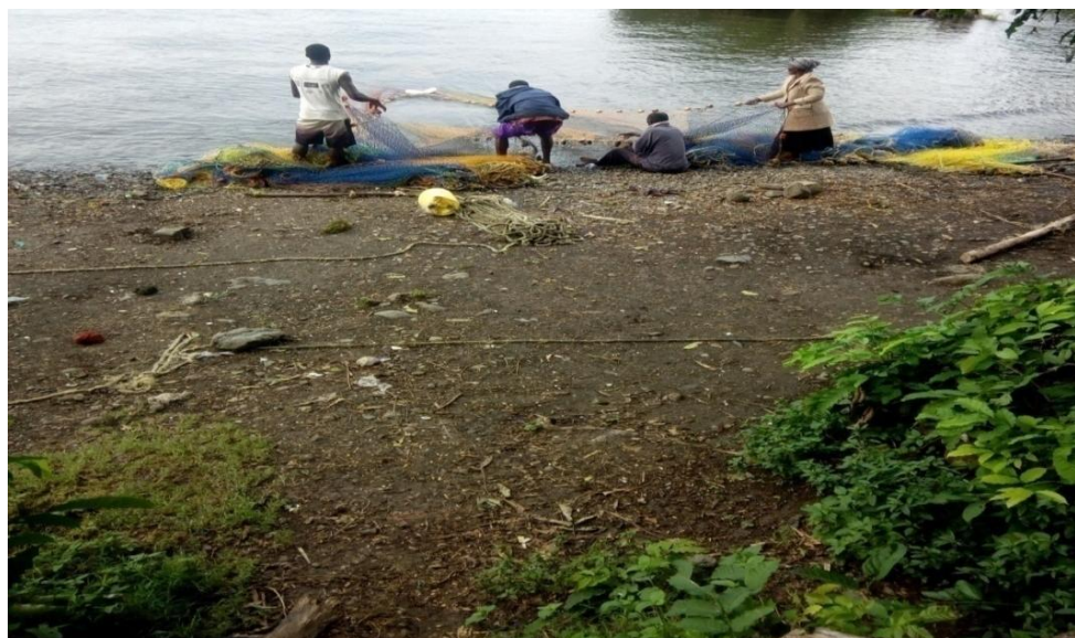
Figure 1.3: A woman and men hauling seine at a beach in Mfangano Island. Women are limited to hauling at the beach an indication of stereotypes in fishing communities.