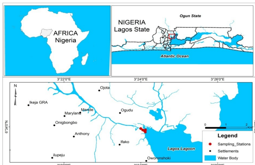
Figure 1. Map depicting the sampling area in Lagos Lagoon

choice of the study point is to have a clear understanding of how the reported contaminated stream would affect Lagos Lagoon at the point at which its discharge.