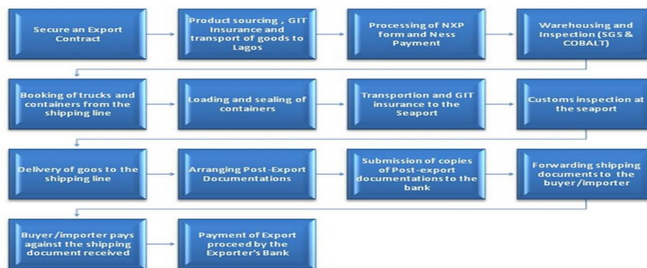
Figure 3 : Procedures for Agricultural Produce Exports from Nigeria Chart