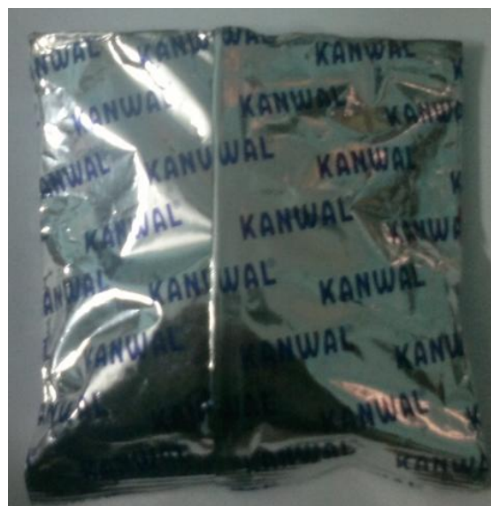
Fig. 5: Package design of Premix