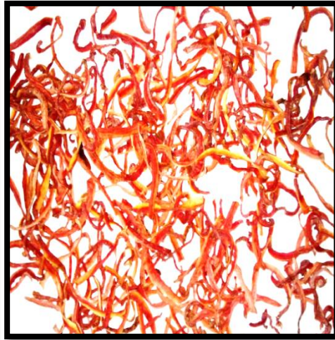
Fig. 2: Dehydrated Carrots