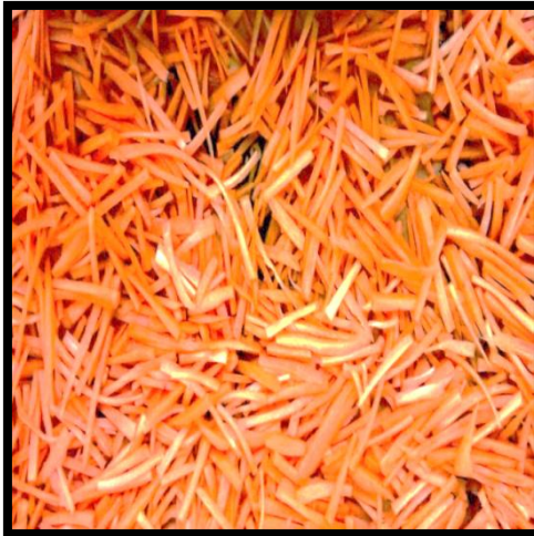
Fig. 1: Sliced Carrots