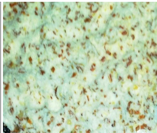
Fig. 4: Pre-mix for Carrot Dessert