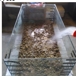
Figure: Component of Hydrologic Cycle in an one side open system.