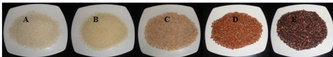
Fig 1. Types of Rice Used for Puttu: From left to right: A) Raw Rice, B) Parboiled Rice, C) Brown Rice, D) Red Rice and E) Black Rice

Puttu flour preparation: Five commercial cultivars of Rice ( Oryza sativa L.) samples namely raw rice (IR20), parboiled rice, brown rice (kaikuthal arisi), red rice (matta rice) and black rice (kavuni rice) were purchased from local markets in Thanjavur. The samples were coded A-E, while Fig.1 shows the photographs of the samples. The samples were cleaned and soaked in water for 1 hour at 30^{\circ}\text{C} . The soaked samples were drained and dried at 30^{\circ}\text{C} . The dried rice samples were ground using a hammer mill (Lab Model: A1, Madurai), and passed through 50-mesh sieve. The ground flour was roasted with an uruli roaster at 140^{\circ}\text{C} for 3 minutes before they were stored in air-tight containers prior to analysis.