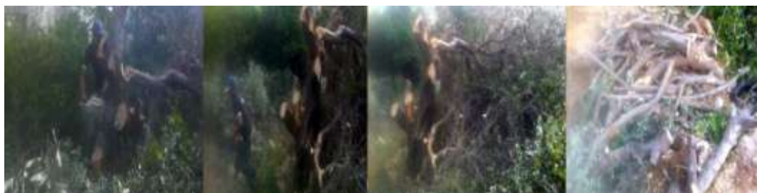
Figure 3: a Syrian was busted by our camera while illegal felling trees in Minieh near an informal tent settlement.

Informal tented settlements are changing land use and mostly transform agricultural areas or with large agricultural trends into tents zones. In further, there is a high impact on forest resources which are close to their settlements. Syrian refugees are benefiting from the absence of laws application in Lebanon by illegal felling of forest without any fear from being captured and are using it as an alternative energy source especially in winter season (Figure 3).