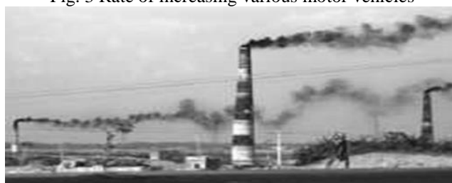
Fig.4 Mushroom growth brick kilns around Dhaka city emit particulate matter