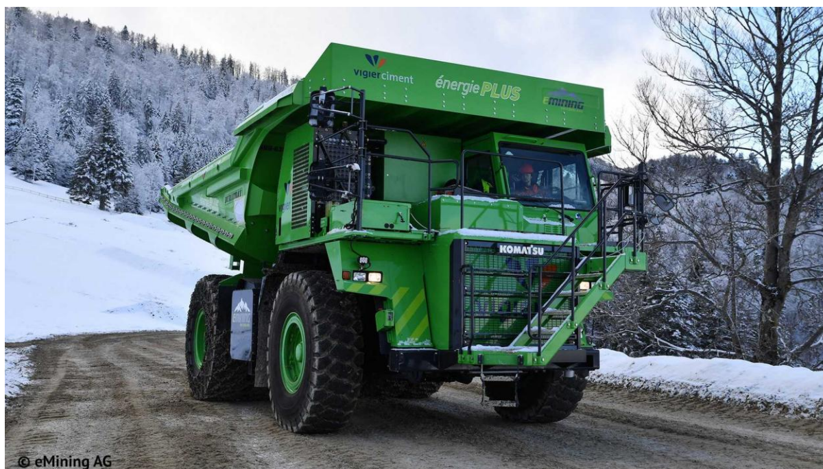
Fig 1: Elektro Dumper

The haul truck (Elektro Dumper) shown in Fig 1 uses RBS technology. This truck climbs up the hill with a full charge, loads up with rocks and then goes back down the hill and recovers the lost energy by using the RBS. Due to the use of this technology, most the energy lost during climbing the hill is recovered by converting the kinetic energy to electrical energy when braking down the hill. This electrical energy is used to charge the battery. Hence the frequency of charging the battery reduces. This leads to increase in efficiency of the truck and decrease in the fuel cost. If RBS is not used, the charging of the battery will be expensive cause the batteries used in these haul trucks has massive battery capacity.