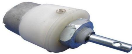
Fig (2). 200rpm, 2kg torque BLDC motor

It is better to understand the function of a brushed motor. In brushed motors, there are permanent magnets on the outside and a spinning armature which contains an electromagnet inside. These electromagnets create a magnetic field in the armature when the power is switched on and help to rotate the armature. The brushes change the polarity of the pole to keep the rotation on of the armature. The basic working principle for the brushed DC motor and for brushless DC motor are the same, i.e. internal shaft position feedback.