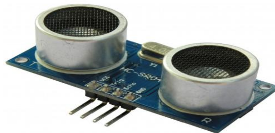
Fig (3): Ultra sonic sensor,5V

An ultrasonic sensor is an electronic device that measures the distance of a target object by emitting ultrasonic sound waves and converts the reflected sound into an electrical signal. Ultrasonic waves travel faster than the speed of audible sound, i.e. the sound that humans can hear. Ultrasonic sensors have two main components: the transmitter which emits the sound using piezoelectric crystals and the receiver which encounters the sound after it has travelled to and from the target.