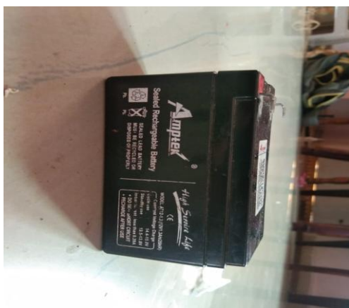
Fig (1): 12V Battery,1.3 Amp hr