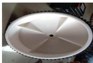
Fig(9): Castro wheels

A caster (or caster ) is an underived, single, double, or compound wheel that is designed to be attached to the bottom of a larger object (the "vehicle") to enable that object to be moved. They are available in various sizes, and are commonly made of rubber, plastic, nylon, aluminum, or stainless steel