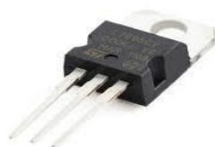
Fig(7): Voltage regulator (5v)