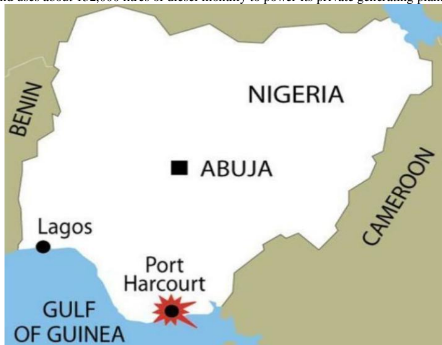
Fig. 1: Map of Port Harcourt

The Port Harcourt International Airport, for instance, relies 100 per cent on generators for the running of the airport and uses about 132,000 litres of diesel monthly to power its private generating plants [7].