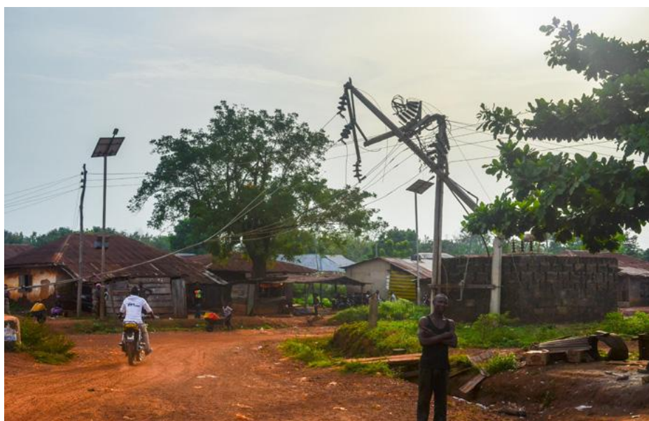
Fig. 3: Broken infrastructure potential cause of power outage.