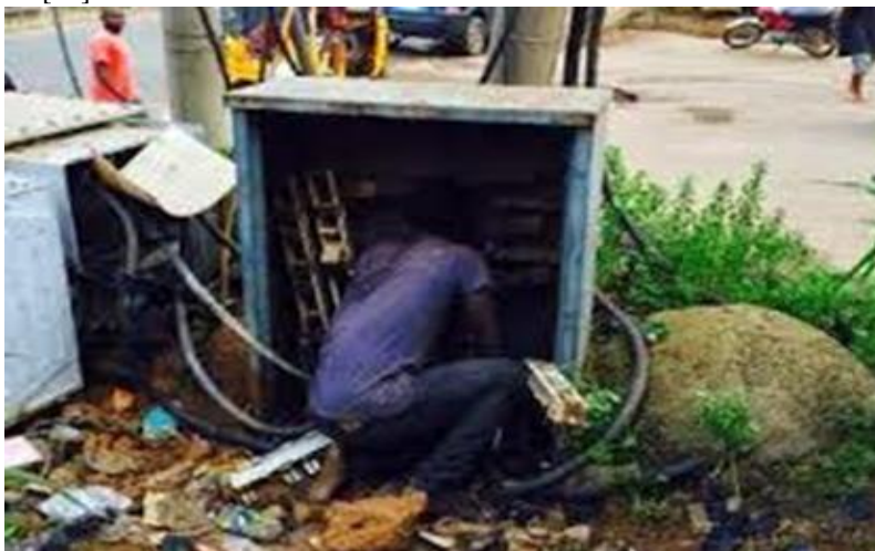
Fig. 4: A Vandal electrocuted in a distribution transformer