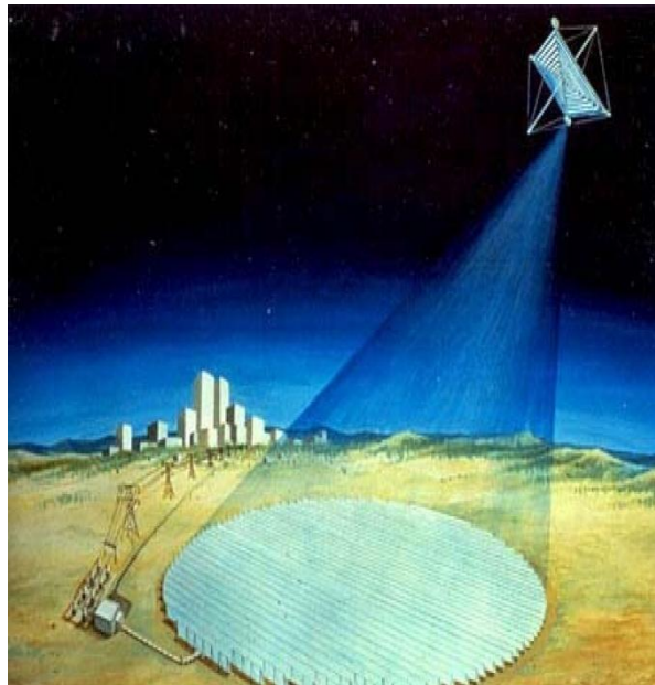
Figure 2 shows a design of Earth Receiving Station (Rectenna)

The SPS system will require a large receiving area with a Rectenna array and the power network connected to the existing power grids on the ground. Although each rectenna element supplies only a few watts, the total received power is in the Gigawatts (GW).