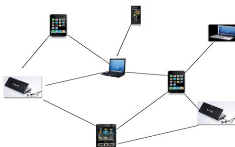
Ad hoc Wireless Network

Nodes in an ad hoc network may be highly mobile, or stationary, and may vary widely in terms of their capabilities and uses [4,5]. They may operate autonomously or connected to the Internet. Environments in which ad hoc networks are initially expected to play an important role include instant infrastructure scenarios, particularly where mobile access to a wired network is either ineffective or impossible. Because of their inherent flexibility, ad hoc networks have the potential to serve as a ubiquitous wireless infrastructure capable of interconnecting thousands of devices [6], and supporting a wide range of networking applications. It is hoped that in the future, ad hoc networks will emerge as an effective complement to wired or wireless LANs, and even to wide-area mobile networking services, such as Personal Communication Systems (PCS). In order to achieve this status, however, applications and services equivalent to those available in these environments must be made available to ad hoc network users.