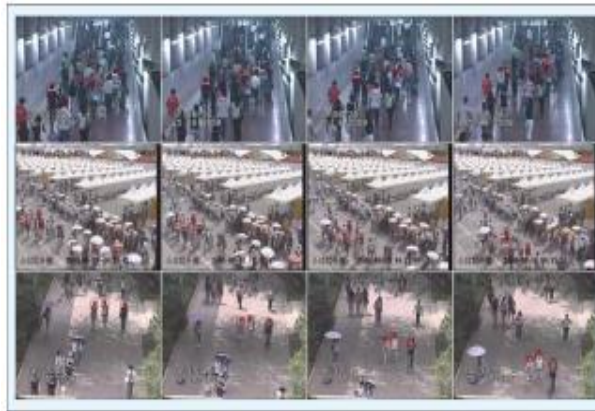
Fig.3 Video sequences and the bounding boxes used for real data by hand.

The crowd information extraction is an important step in crowd density estimation. Here the comparison of AMID method with the GMM method. GMM is a well-known background modeling method, which can work in clutter background in real time for motion detection and can handle swaying trees, ocean waves, etc., while GMM cannot be used for high crowd density estimation.