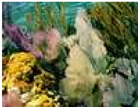
100 x 75 pixels

As the process follows, the original captured images say the images as shown below with their respective dimensions is considered for encryption. Initially the color RGB components are extracted separately using Matlab version 7.6.