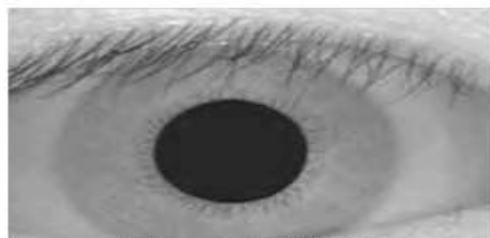
(b) Output of JPEG 2000