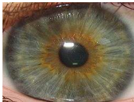
Figure 1. A front view of human eye

The iris is a thin circular diaphragm, which lies between the cornea and the lens of the human eye. A front view of the iris is as shown in the figure 1. The function of iris is to control the amount of light entering through the pupil and this is done by the sphincter and the dilator muscles, which adjust the size of the pupil. The average diameter of the iris is 12 mm and the pupil size can vary from 10% to 80% of the iris diameter.[2] Formation of iris begins during the third month of embryonic life.[3] The unique pattern on the surface of the iris is formed during the first year of life and pigmentation of stroma takes place for first few years. The density of stromal pigmentation determines the colour of the iris. The externally visible surface of the multilayered iris contains two zones, which often differ in colour. An outer ciliary zone and the inner pupillary zone and these two zones are divided by the collarets which appears as a zigzag pattern.[2]