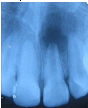
Figure 1 Preoperative view