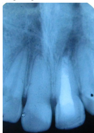
Figure 4 6 months postoperative