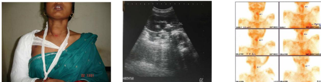
FIG-3: Patient Profile FIG-5: USG Showing Renal Stone FIG-6: SESTAMIBI Scan of PHPT

Age distribution of PHPT in our study seems to expand in every age group (25 to 50 years) which is similar to Thailand but not Taiwan [7]. To design a screening age group of PHPT for early detection in India would need further information. Skeletal and renal related symptoms were the leading clinical presentation of symptomatic PHPT. In this study all the patients presented with pathological fracture [FIG 1-4], 33.3% with renal impairment [fig.5], 25% with neuromuscular symptoms and 8% with neuropsychiatric symptoms. These clinical features represented the late diagnosis and showed similar pattern of symptoms to other Asian countries. Although all fractures were re-united after parathyroidectomy, the period of treatment was relatively longer than in healthy bone (5–20 months). Anyhow, the renal consequences such as renal calculi and impairment did not improve after parathyroidectomy.