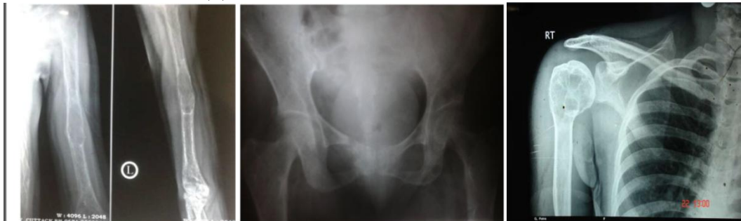
FIG-1,2,4: SKELETAL MANIFESTATIONS OF PHPT

Age distribution of PHPT in our study seems to expand in every age group (25 to 50 years) which is similar to Thailand but not Taiwan [7]. To design a screening age group of PHPT for early detection in India would need further information. Skeletal and renal related symptoms were the leading clinical presentation of symptomatic PHPT. In this study all the patients presented with pathological fracture [FIG 1-4], 33.3% with renal impairment [fig.5], 25% with neuromuscular symptoms and 8% with neuropsychiatric symptoms. These clinical features represented the late diagnosis and showed similar pattern of symptoms to other Asian countries. Although all fractures were re-united after parathyroidectomy, the period of treatment was relatively longer than in healthy bone (5–20 months). Anyhow, the renal consequences such as renal calculi and impairment did not improve after parathyroidectomy.