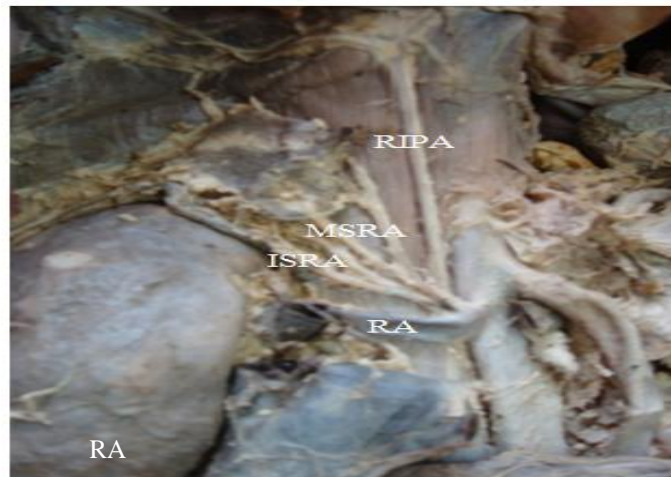
Fig.5. Inferior phrenic artery (IPA) , 2 Middle supra renal (MSRA) & 2 Inferior suprarenal arteries (ISRA) arising in common from a point where renal artery(RA) originated from the abdominal aorta.