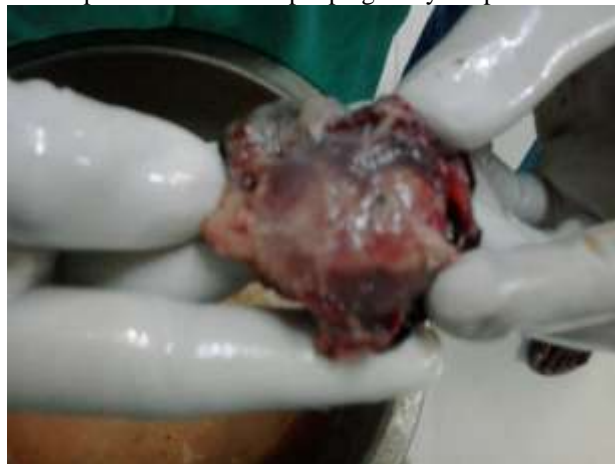
Fig 3: Picture showing fetus ensac which was obtained from POD.