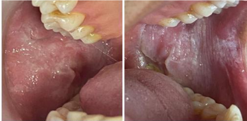
Fig.1(A): Right Buccal Mucosa

Fig.1(A)&(B) Showing Symmetrical Irregular, Well-Defined Borders.White Plaques And Patches On The Buccal Mucosa.