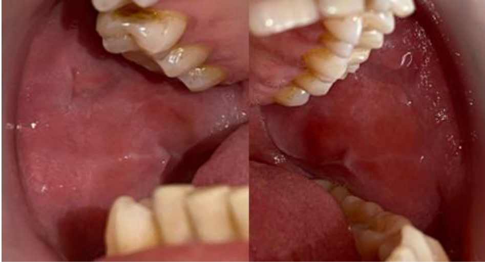
Fig.3(A): Rt. Buccal Mucosa