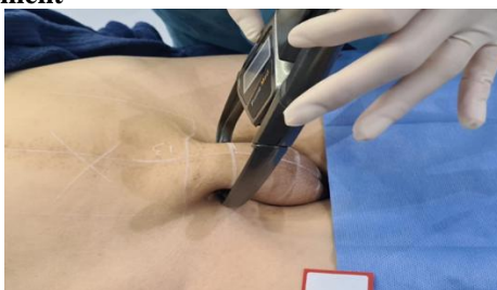
Figure 04: Marking and Documentation with adipometry collection