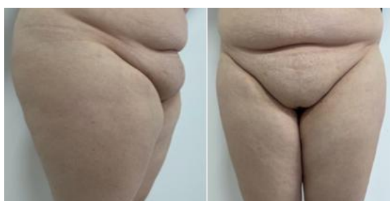
Figure 02: 36-year-old woman, two pregnancies, complains of localized fat volume, combined with sagging, sought treatment to improve her self-esteem and comfort when wearing tighter clothes. (author's correction)

In evolutionary terms, this fat can also play a role in protection during physical activities, reducing the impact on the pelvic bones and genitals. Its form of deposition is also observed as a fundamental structure of comfort during female sexual intercourse, protecting against the rhythmic impact. However, its aesthetic impact, especially in women seeking a more defined body contour, reducing the protrusion of volume in this region when wearing tighter clothing or bathing suits, is a factor that generates interest in treatments targeted at this area.