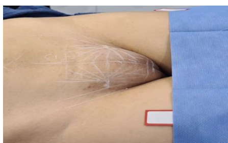
Figure 05: Planning for endolaser pubic symphysis