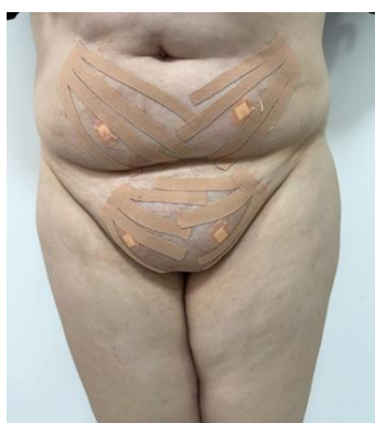
Figure 06: Post-procedure patient with immediate tapping application after the procedure and instructed to maintain it for 72 hours

You can use taping on the area to avoid edema and discomfort or shapewear shorts with moderate compression, which will also make it easier.