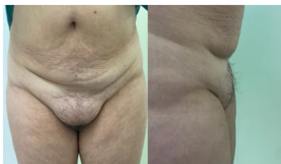
Figure 03: 54-year-old woman complains of localized fat volume in the pubic symphysis region, with discomfort when wearing a bikini or tight pants.