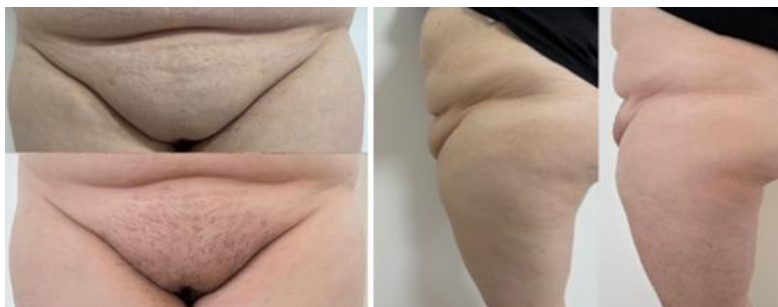
Figure 07: Before and After Photo Documentation

The use of endolaser for localized fat in the pubic region is indicated for patients with fat that is resistant to diet and exercise. It is important to note that this procedure must be performed by qualified professionals and in a suitable clinical environment to avoid complications such as burns or fibrosis.