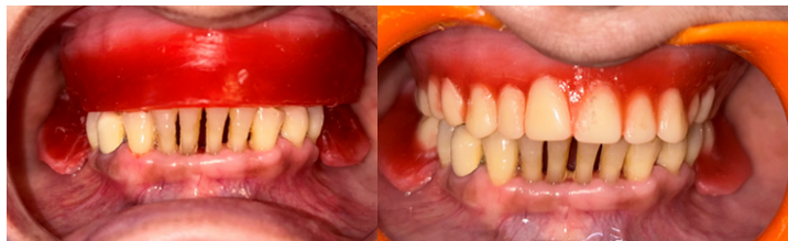
FIG 7- JAW RELATION RECORDED