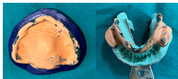
FIG 4- PRIMARY IMPRESSION OF MANDIBULAR ARCH