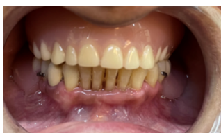
FIG 9- DENTURE DELIVERY