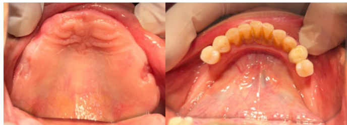
FIG 1- MAXILLARY ARCH