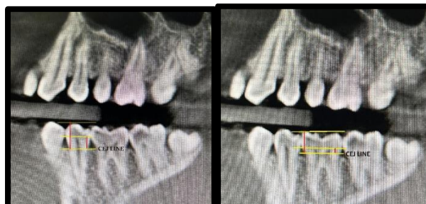
Figure 1: a) Sagittal section of CBCT with measurements on mandibular second