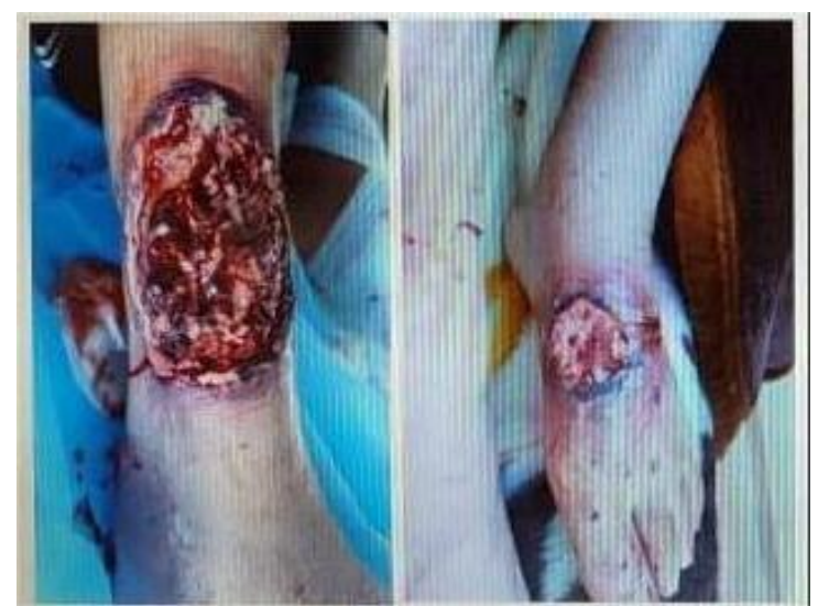
Figure 1 : Ulcers on the lower third of the right leg and left foot, well-defined, oval-shaped, with granulating tissue, violaceous borders, and surrounded by an erythematous halo.

additional abdominal-pelvic MRI also confirmed the splenic abscesses. Based on a clinico-pathological and radiological correlation, a diagnosis of pyoderma gangrenosum with aseptic splenic abscesses was made and confirmed (Figure 3). The patient was started on high-dose oral corticosteroid therapy at 1 mg/kg/day, a rapid radio-clinical and biological improvement was observed after the introduction of corticosteroid therapy.