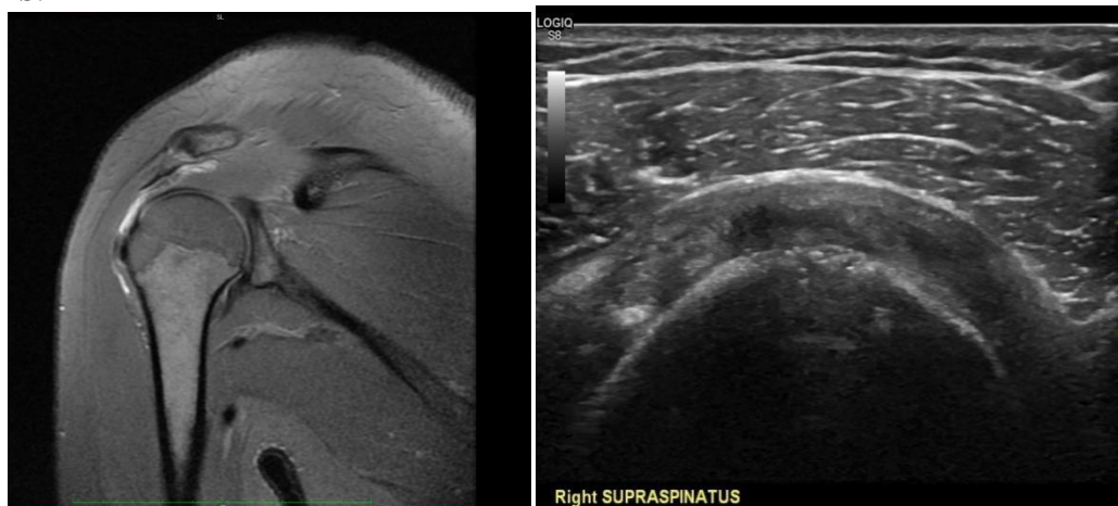
Partial thickness tear in supraspinatus tendon as seen on MRI and USG .