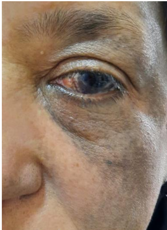
Figure 2 : Photograph showing oculopalpebral nevus OS

B-scan ultrasonography revealed a parietal echogenic process with moderate reflectivity measuring 16.88 mm in thickness with the sign of choroidal excavation present, a satellite retinal detachment and without extrascleral extension. (Figure 3)