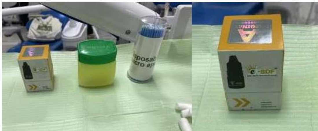
Figure 1: Materials used in the SDF application