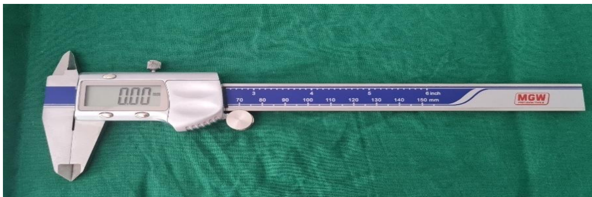
Fig. 1: Digital caliper

Statistical analysis: All the data were coded and entered Microsoft Excel 2007 and then transferred into IBM SPSS version 20.0 software for statistical analysis. Quantitative data were interpreted as mean \pm SD. The level of significance was considered statistically significant at p \leq 0.05 .