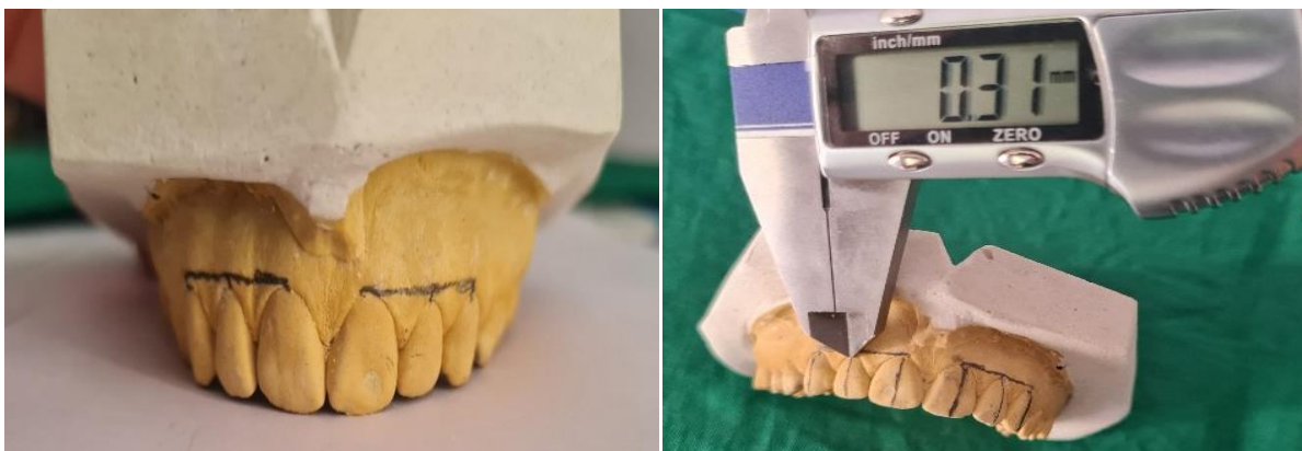
Fig. 3: Measurement of Gingival Zenith markings