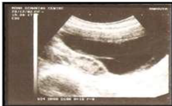
USG - Necklace pattern of PCO

Informed consent to include in the study was taken. Careful counselling regarding antenatal complications was done. Early pregnancy scan was done. Initial HbA1c was done at confirmation of pregnancy. Oral progesterone supplementation was started. Oral GTT was done at 20,28 and 32 weeks. Blood pressure monitoring was done regularly. Serial ultrasound scans were done. Early pregnancy scan was done at booking visit. NT scan was done at 12 weeks along with uterine artery Doppler. TIFFA scan was done between 18-22 weeks of pregnancy. Serial growth scan was done at 28,32 and 36 weeks. Obstetric ultrasound for biophysical profile, amniotic fluid, placental grading/site.Uterine artery Doppler was done to rule out PIH. When no maternal illness, no CPD is present, normal vaginal delivery was allowed. When pregnancy with PIH, GDM, long marital life and BOH is present, elective LSCS was done.