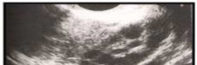
USG - Stromal