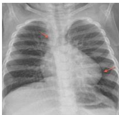
Fig 2 : Preoperative Chest X-Ray.

coronary scanner (Fig 3) Preoperative chest X-ray also shows the cardiac malformation.