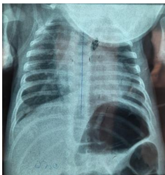
(Fig 4) Postoperative pneumonia.

Following anesthetic induction with Midazolam, Sufentanil, and Rocuronium, and invasive arterial pressure monitoring, the child experienced pulmonary hypertensive crisis requiring intraoperative resuscitation. Norepinephrine was used as the vasopressor. Vascular filling was achieved with 9‰ saline solution. Particularly, efforts were made to avoid pulmonary hyperperfusion at induction of general anesthesia induced by 100% preoxygenation and hyperventilation, while controlling the shunt by increasing systemic vascular resistance and reducing pulmonary vascular resistance. The average duration of the intervention was 1 hour and 45 minutes, with awakening on the operating table and the child extubated while asleep. Postoperatively, multimodal analgesia consisted of Morphine and Paracetamol. Postoperative complications included hypercyanotic spells with convulsions, requiring reintubation, and pneumonia (Fig 4) due to esotracheal fistula.