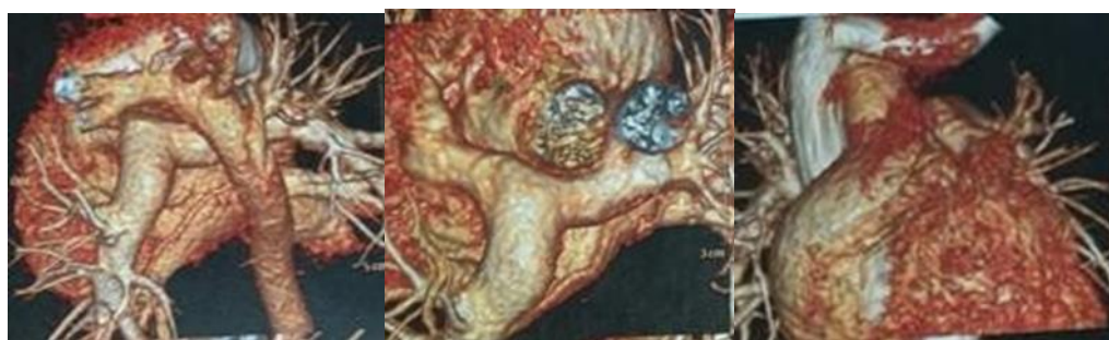
Fig 3: Coronary Scanner

coronary scanner (Fig 3) Preoperative chest X-ray also shows the cardiac malformation.