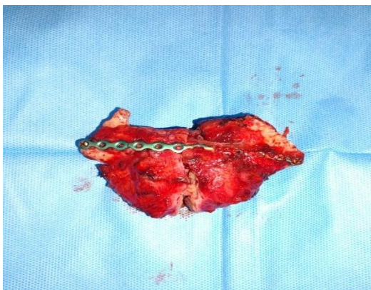
Figure-4 Resected specimen