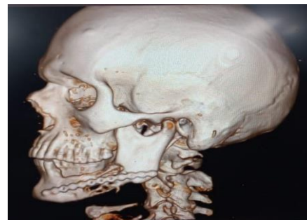
Figure-2b Postoperative 3D reconstructed CT with implant insitu