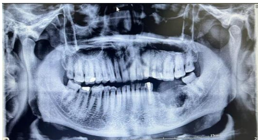
Figure-1a Preoperative Orthopantomogram

Histopathological examination was suggestive of ameloblastoma. This prompted us to diagnose the case as a recurrence of ameloblastoma in the iliac crest graft. Plan for surgical resection of the lesion with removal hardware via existing extra-oral scar, which was supported with a stereolithographic model (Figure 3a,3b). Post surgical histopathology of the specimen (Figure 4,5a,5b) revealed proliferation of odontogenic epithelial cells in sheets and follicular islands with plexiform and cribriform arrangement. The basilar cuboidal cells along with juxta epithelial eosinophilic dentinoid material was seen, which were suggestive of adenoid ameloblastoma. Post-op recovery was uneventful. Patient is on periodic recall visits and planned for definitive reconstruction after a prolonged follow up owing to recurrent nature of lesion.