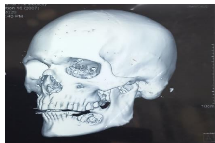
Figure-1b Preoperative 3D reconstructed CT