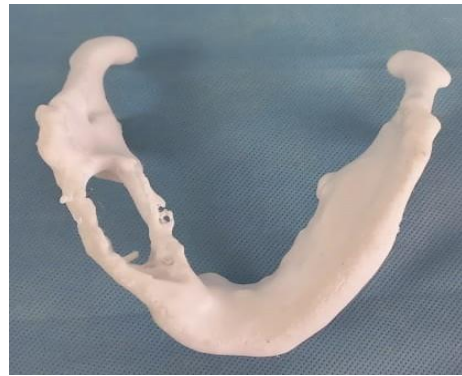
Figure-3b Stereolithographic model axial view