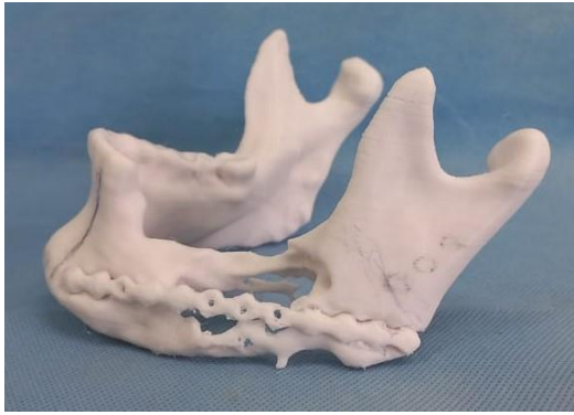
Figure-3a Stereolithographic model left lateral view