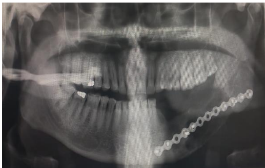
Figure-2a Postoperative orthopantomogram with implant insitu