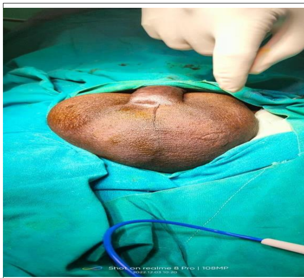
Figure 1 -clinical presentation of bilateral scrotal swellings.

On investigating, scrotal ultrasound showed two large cystic swellings arising from both epididymal heads of size measuring 80X 60 mm on the left and 100 X 70 mm on the right. Both testes appeared normal in size, shape, and echogenicity with the normal color flow in the doppler scan.