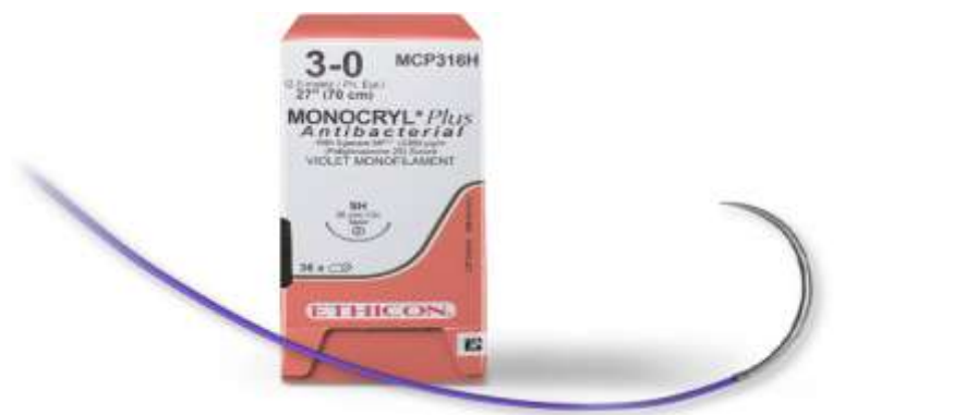
Fig 3- Antibacterial sutures; Courtesy: Medical design&Outsourcing