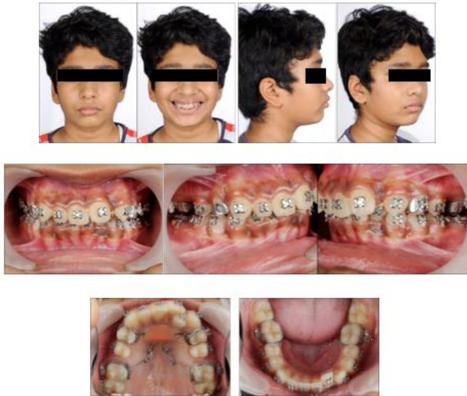
Fig.3, Post distalization extra oral and intra oral photographs

Upper and lower teeth were bonded with 0.022" MBT bracket and premolars were distally driven into space obtained by distalizing upper first permanent molars. This helped in alignment and correction of crowded upper anteriors. Post fixed orthodontic treatment crowding was relieved both in upper and lower anterior teeth. Both upper and lower arches were well aligned, deep bite was relieved and consonant smile arc achieved.