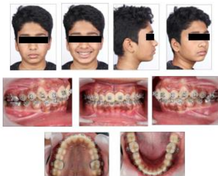
Fig.4, Post treatment extra oral and intra oral