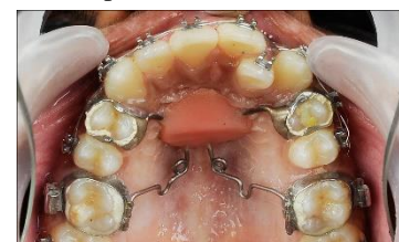
Fig.2, Pendulum appliance

Post distalization Nance palatal button maintained the distalization space, which was achieved by pendulum appliance.