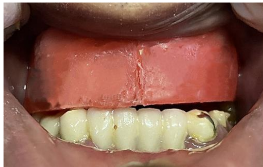
Figure 8: Jaw relation and bite registration

The patient's vertical dimension was recorded and maxillary rim was adjusted accordingly against the natural mandibular teeth (figure 8). The teeth arrangement was done and denture was cured with the temporary cylinders in place (figure 9). Only the crest of the denture base was allowed to remain in contact with the residual ridge and the lingual, labial, and buccal flanges were removed to the desired length. The prosthesis was highly polished to minimize plaque retention and was seated in the mouth (figure 10). Following this, the required occlusal adjustments were made. The screw access holes were covered with Teflon tape followed by composite (figure 11). The patient was given the post insertion recommendations. The patient was recalled after four months for the final prosthetic procedures.