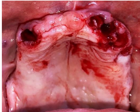
Figure 3: Intra oral view after extraction