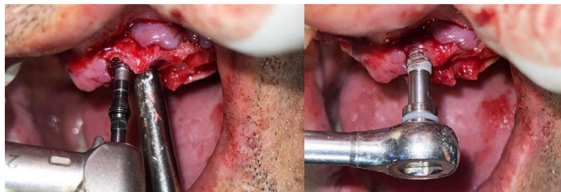
Figure 4: Implant placement