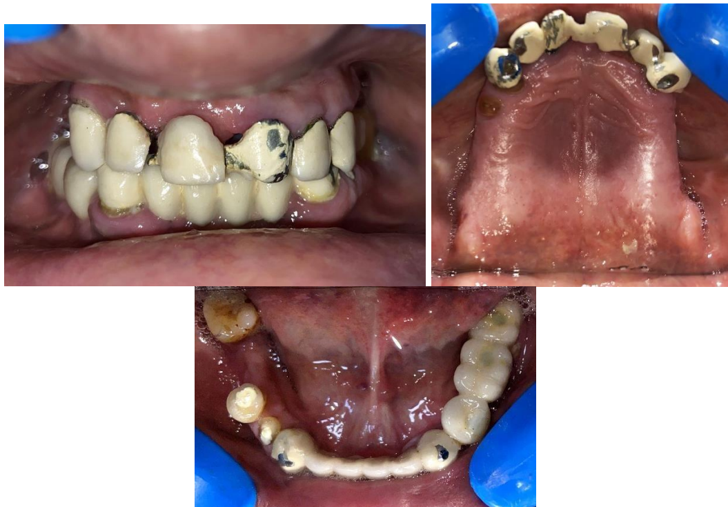
Figure 1: Pre operative intra-oral view

A 60-year-old male patient reported to the Department of Prosthodontics with a chief complaint of mobile bridge in the maxillary anterior region and wanted replacement of the same. On intraoral examination, Kennedy's class I edentulous span was found. Clinical and radiographic examinations were carried out and revealed multiple missing teeth, non-restorable teeth, periodontal disease, and bone loss. The final treatment plan that was then proposed to and accepted by the patient which included extraction of all remaining teeth in the maxilla, delivery of a provisional fixed restoration supported by six implants.