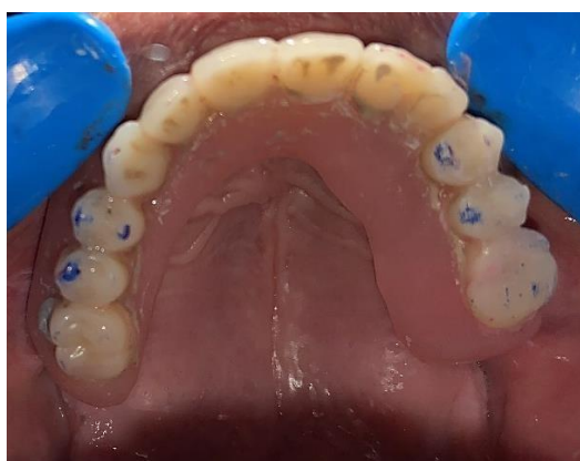
Figure 11: Occlusal view of the provisional prosthesis