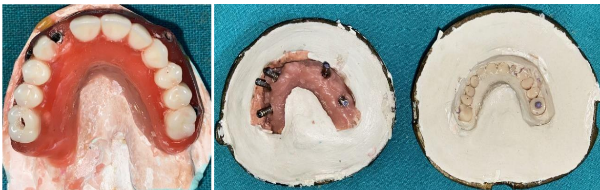
Figure 9: Wax-up and curing of the denture with the temporary cylinders in place