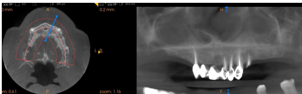
Figure 2: Treatment planning using CBCT