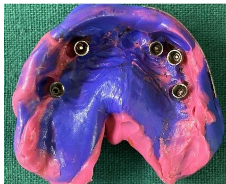
Figure 6: Implant-level impression with Putty- light body

Post healing the temporary cylinders were removed and impression copings were placed on the implant. A splint type implant-level impression was taken with putty-light body (figure 6). The implant in the region irt 21 was left as a sleeping implant because it lacked primary stability.