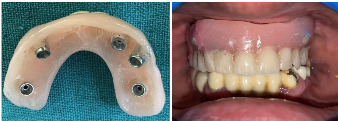
Figure 10: Processed and polished denture base.