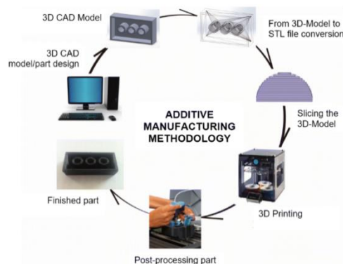
(FIGURE 1:- cycle describing about the process of additive manufacturing methodology)

Thus ,this article discusses about the additive manufacturing which is being mainly used in the field of dentistry.