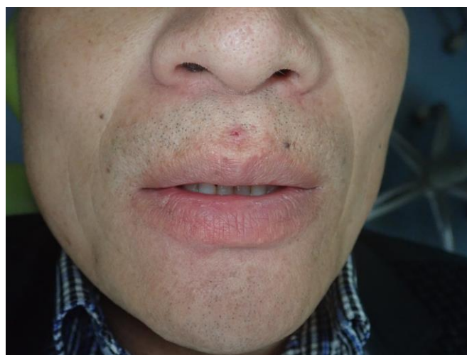
Figure 3 showed the manifestations of the lower lip after multi-point intralesional injection of the combined triamcinolone acetonide 40mg and 1ml 2% Lidocaine for 10 days