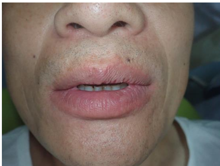
Figure 2 showed the manifestations of the lower lip 14 days later (after the immediate treatment of the tooth #37 with root canal therapy for 14 days)