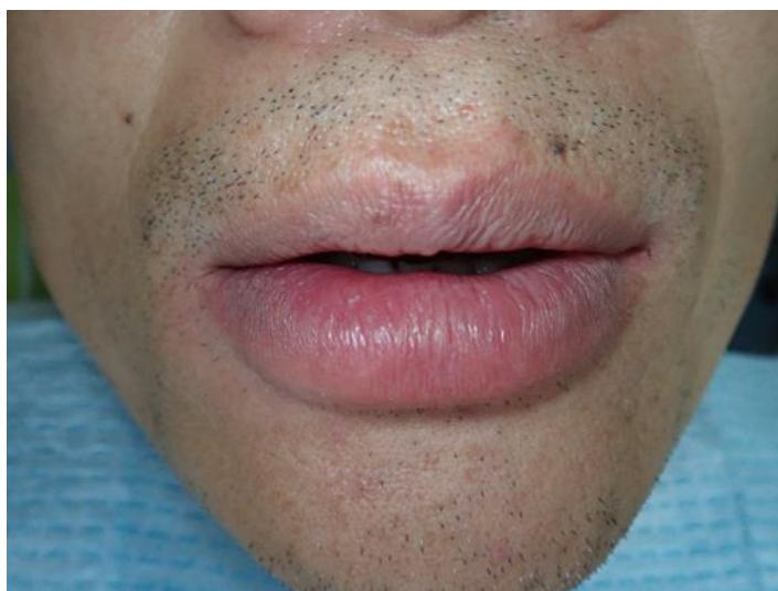
Figure1 showed the manifestations of the lower lip