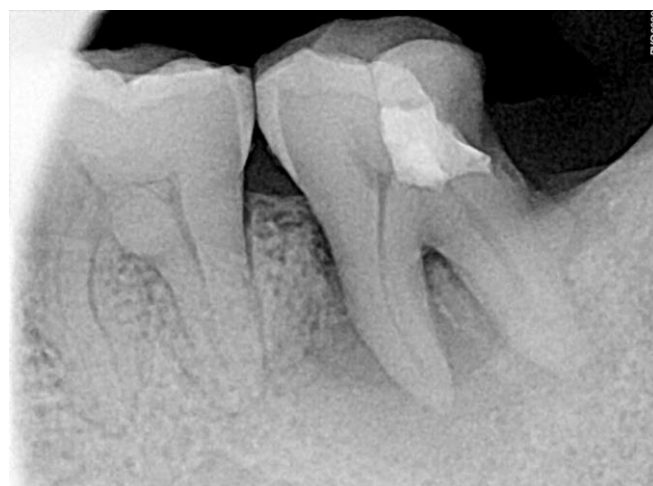
Figure 5 showed apparent periapical radiolucency suggestive of apical periodontitis of the tooth #37