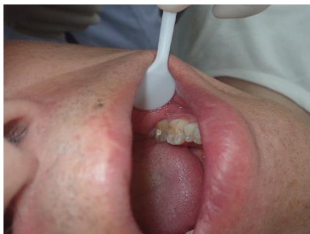
Figure 4 showed the manifestations of the tooth #37