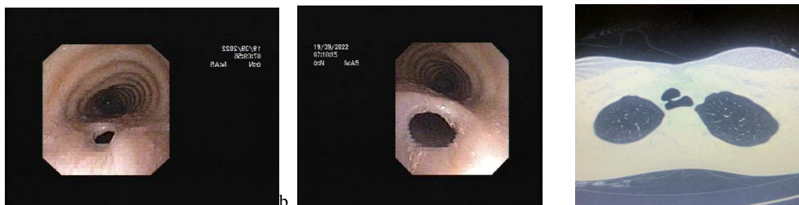
Fig .2 Tracheoesophageal fistula 15-year-old female