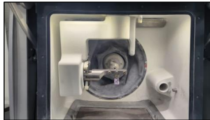
Fig 4: Wet milling of lithium disilicate ingot