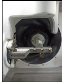
Fig 3: Wet milling of zirconia reinforced lithium silicate ingot