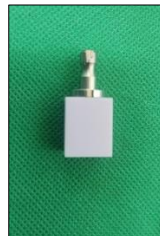
Fig 2: Lithium disilicate ingot (IPS e.max CAD; Ivoclar Vivadent, Schaan, Lichtenstein)