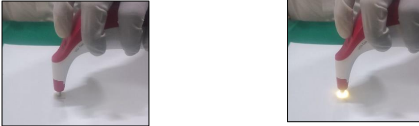
Fig 6: testing of samples on white background