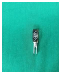
Fig 1: Zirconia reinforced lithium silicate ingot (Vita Suprinity; Vita Zahnfabrick, Bad Säckingen, Germany)