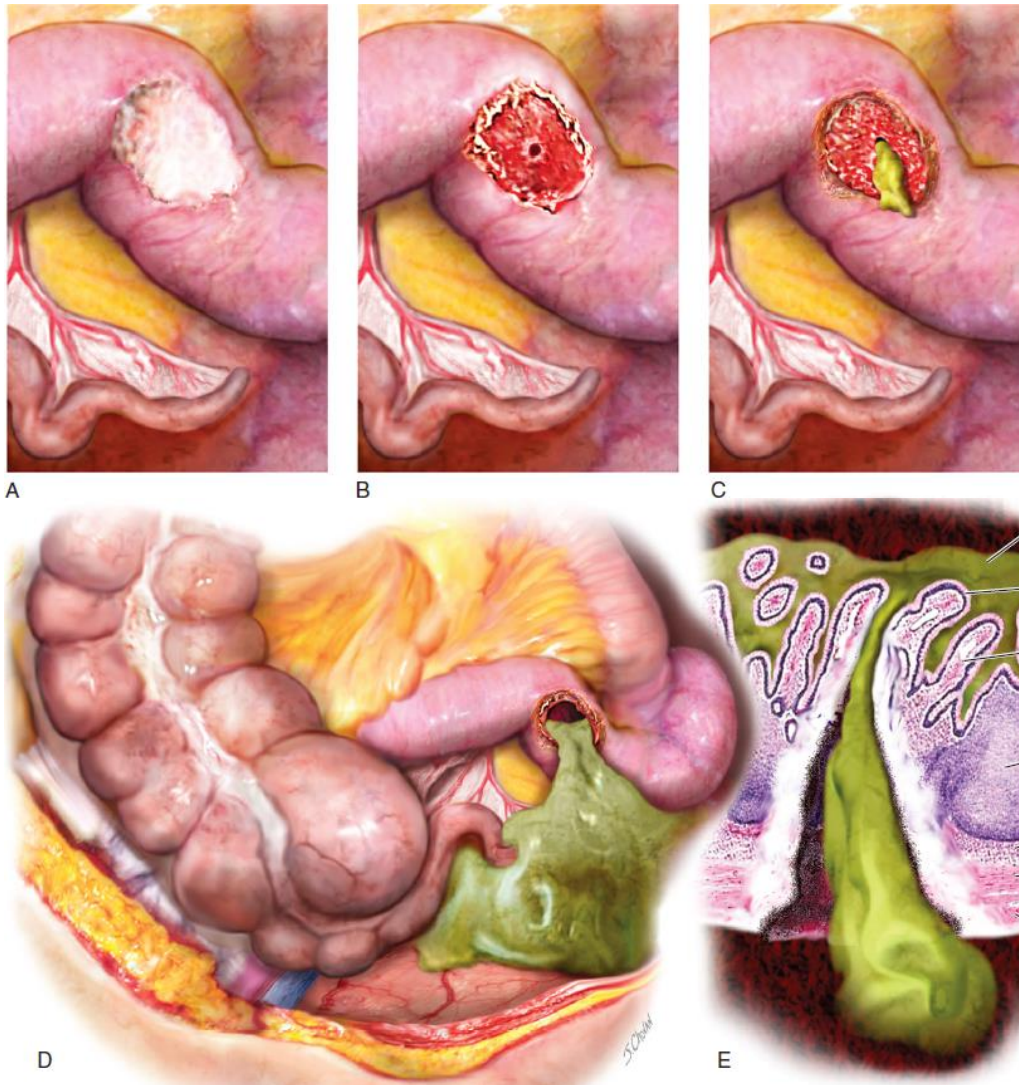
Fig 3 :A. Thermal injury creates a superficial wound in the ileum. B. Within 24 to 36 hours, the burnt eschar has detached, exposing a transmurular lesion and a small perforation. C.D. Flow of bile-stained digestive fluid through perforation, and E. Microscopic section showing transmurular perforation[22]